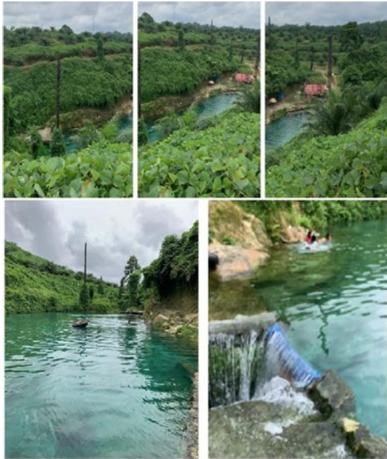
Figure 1. Documentation

The urgency of this research is further underscored by global publication trends. While research on biophilic design in tourism settings has grown steadily (from approximately 12 Scopus-indexed publications in 2020 to over 62 in 2025), integrated studies combining biophilic design with eco-village frameworks specifically for water-spring tourism in Indonesian plantation contexts remain scarce (Figure 2). This gap represents both a scholarly opportunity and a practical imperative for evidence-based design interventions that can be adapted across similar agro-tourism landscapes in Sumatra and beyond.