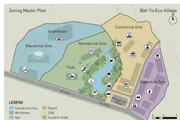
Figure 3. Zoning Master Plan for Bah Tio Eco-Village. The central Recreational Zone (green) is encircled by Educational (blue), Commercial (beige), and Supporting (purple) zones, with direct yet buffered access for ME/SE functions. Permeable access roads, green buffers, and facility icons reflect biophilic and low-impact development principles.

the surrounding ring with direct Recreational Zone access, enhancing operational efficiency at the potential cost of visual or acoustic intrusion. The recommended configuration (Alternative 2 with mitigation) incorporates landscape buffers, green walls, and careful siting to reconcile efficiency and experiential quality. The master plan (Fig. 3) illustrates this integrated zoning.